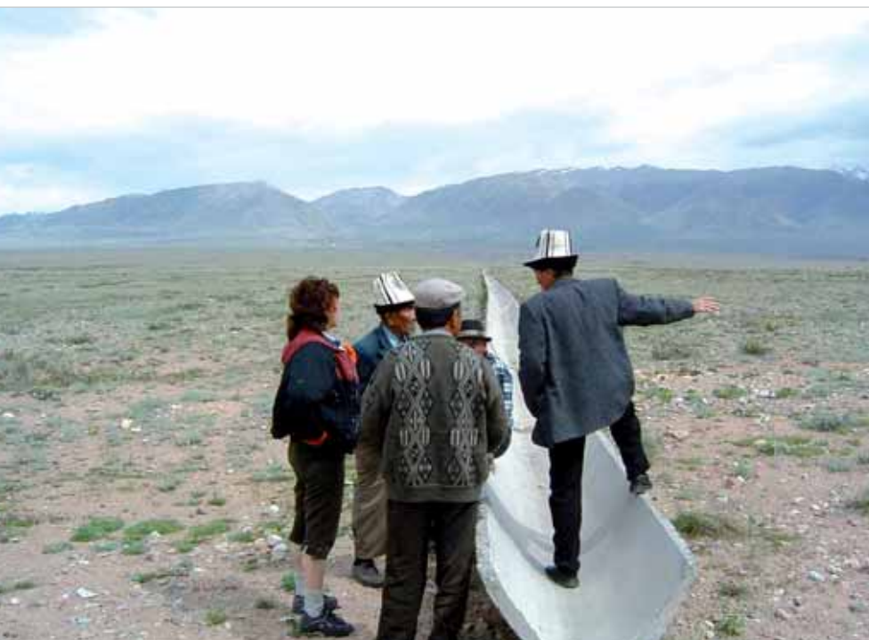
Helplessly waiting for water. Long and intransparent decision-making processes, lack of information and financial means, and an uncertain economic future cause many grassroots initiatives to lose their impetus.

The task of finding an effective approach to implementing the Convention in this environment, influenced by