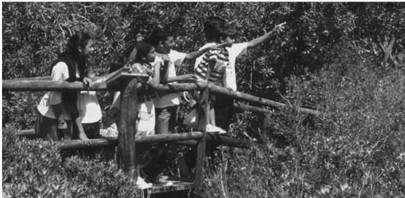
School kids observing the flora and fauna in a nature reserve. Rondevlei Education Centre, Cape Town, South Africa.

Beyond belief. Nigel Dudley, Liza Higgins-Zogib, Stephanie Mansourian. WWF, 2005. 143 p. http://assets.panda.org/downloads/beyondbelief.pdf